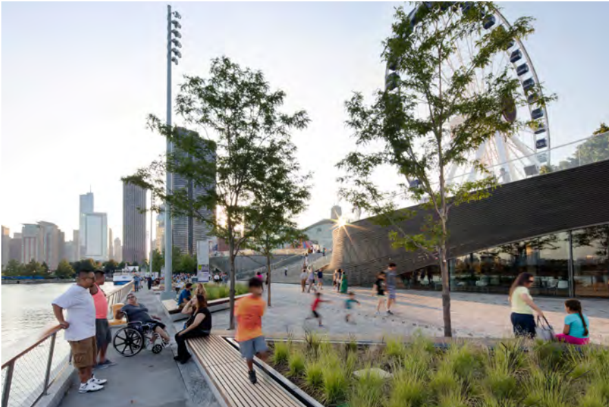
Chicago Navy Pier

http://www.sustainablesites.org/chicago-navy-pier