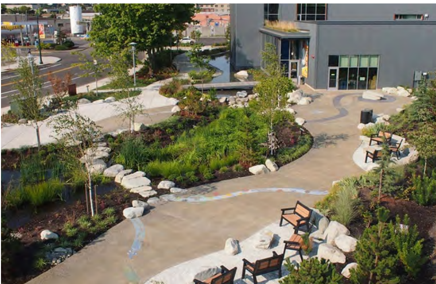
East Bay Public Plaza

http://www.sustainablesites.org/hipps-center-sustainable-landscapes